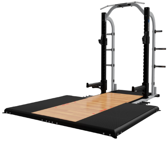
*Platform shown with Half Rack HDHR2