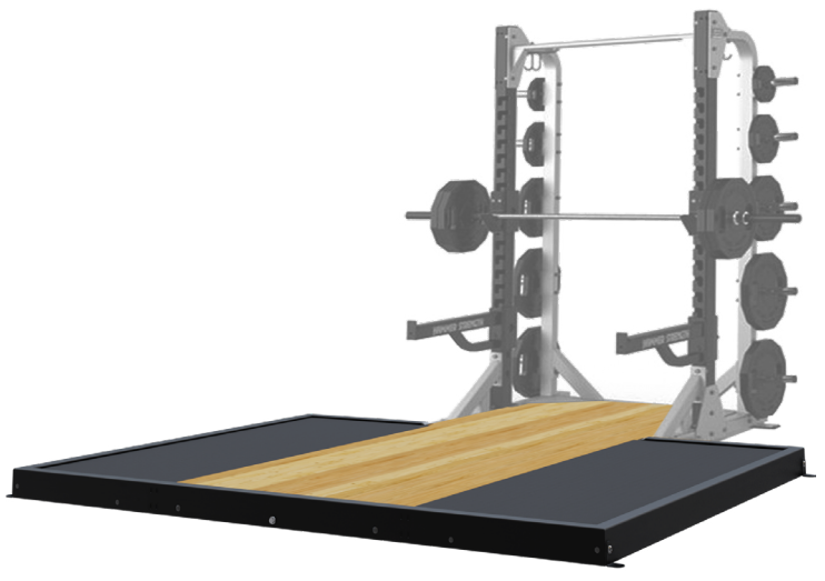
*Platform shown with Life Fitness HD Elite Half Rack